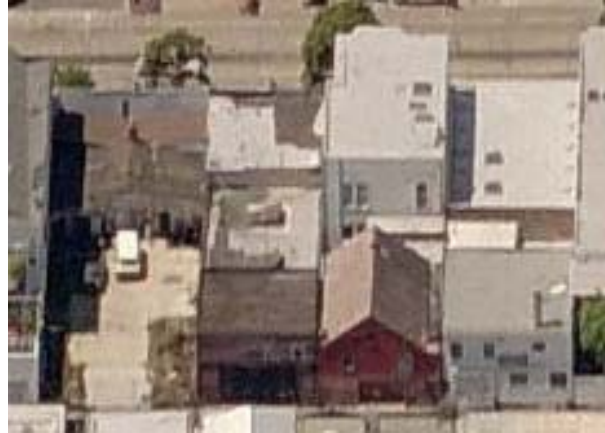
West side of Orange Alley between 25 th and 26 th Streets.

The Orange Alley buildings that comprise this historic district (originally four in number, two of which have been semi-attached with a common façade on Valencia Street) all have a “back-lot” orientation, subordinate to detached or semi-detached, front-lot structures facing Valencia Street. Among the back-lot buildings, the oldest is the gable-roof red barn (second from the north) that was constructed in the 1890s to serve the private residence at 1427 Valencia Street, located at the front of the lot and built at the same time. On the southern portion of the wide lot to the south, owner V. Tamo constructed a single-story, redwood-frame livery with stores on Valencia Street and stalls for a dozen horses, as well as a wood and coal yard, in 1907. The remainder of the wide lot was built out in 1911 by R. O’Connell with frame construction on concrete foundation: a single-story “wood, hay, and coal” facility at the front of the lot and two-story stables at the rear (though the building permit specified “no horses”). Two years later, the owner/occupant of the house and barn at 1427 Valencia, John A. Christen, commissioned the construction of a two-story dairy depot at the back of the lot to the north, 1423 Valencia Street, and removal of the older, smaller dwelling. The creamery, a frame building on a brick foundation, completed the original row of four horse-oriented commercial and service buildings along Orange Alley.