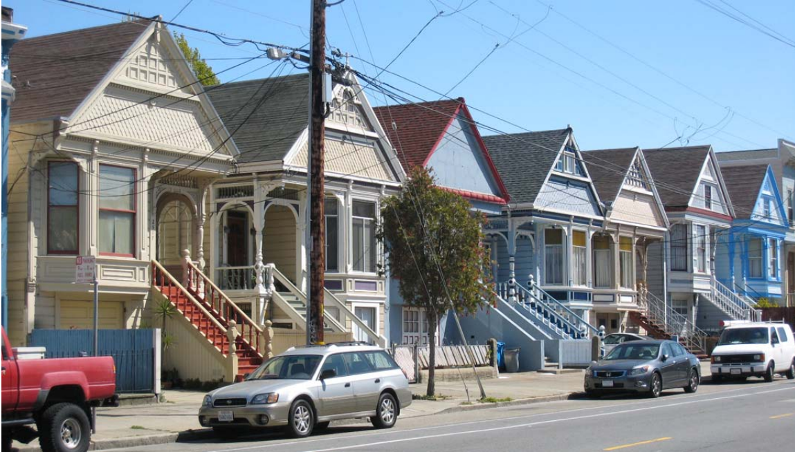
East side of Harrison Street between 21 st and 22 nd Streets.

Boundaries: East side of Harrison Street between 21 st and 22 nd Streets